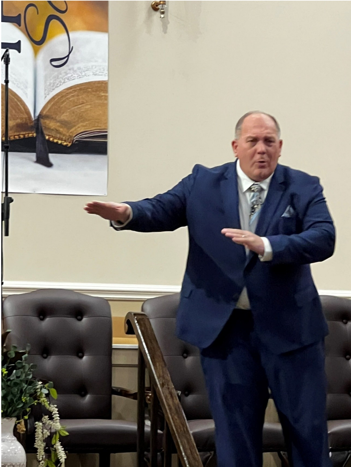
Tremendous Preaching At The Pastor's Fellowship