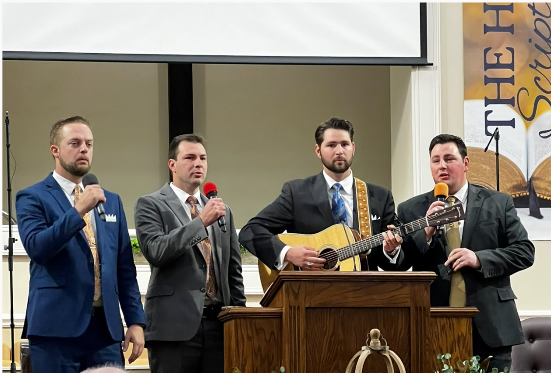
Great Music At The Pastor's Fellowship