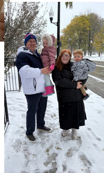
Our first big snow of 10 inches