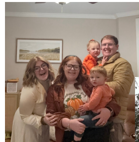
Our sister visited us for Thanksgiving