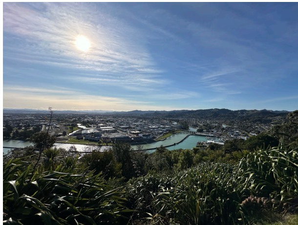
Left: The view from an outlook point over the city of Gisborne.