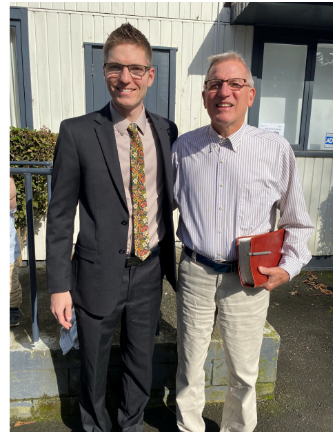
Right: I got to spend Father's Day (first Sunday in September in NZ) with my dad.