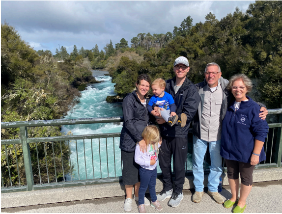
Left: It was fun to have my parents join us for a couple of weeks.